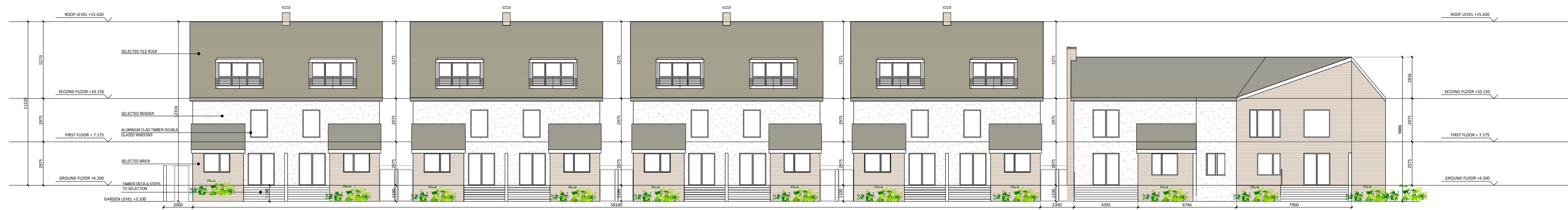
REAR NORTH ELEVATION APPROVED