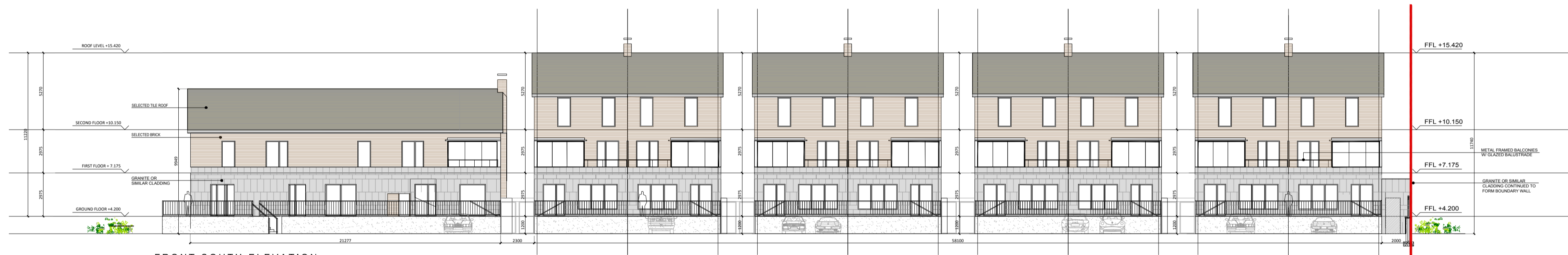
FRONT SOUTH ELEVATION APPROVED