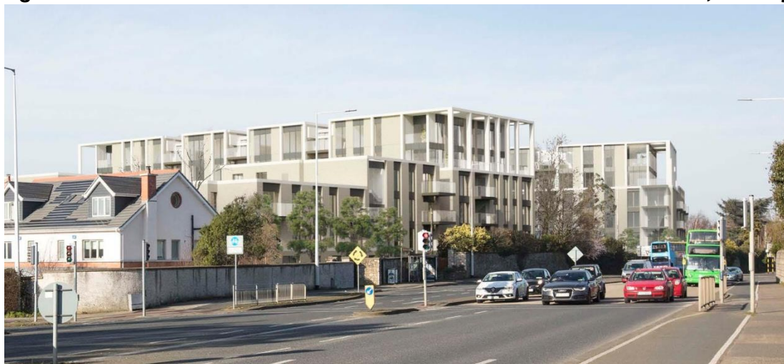
Figure 4.1: CGI of Permitted SHD at Churchview Road and Church Road, Killiney