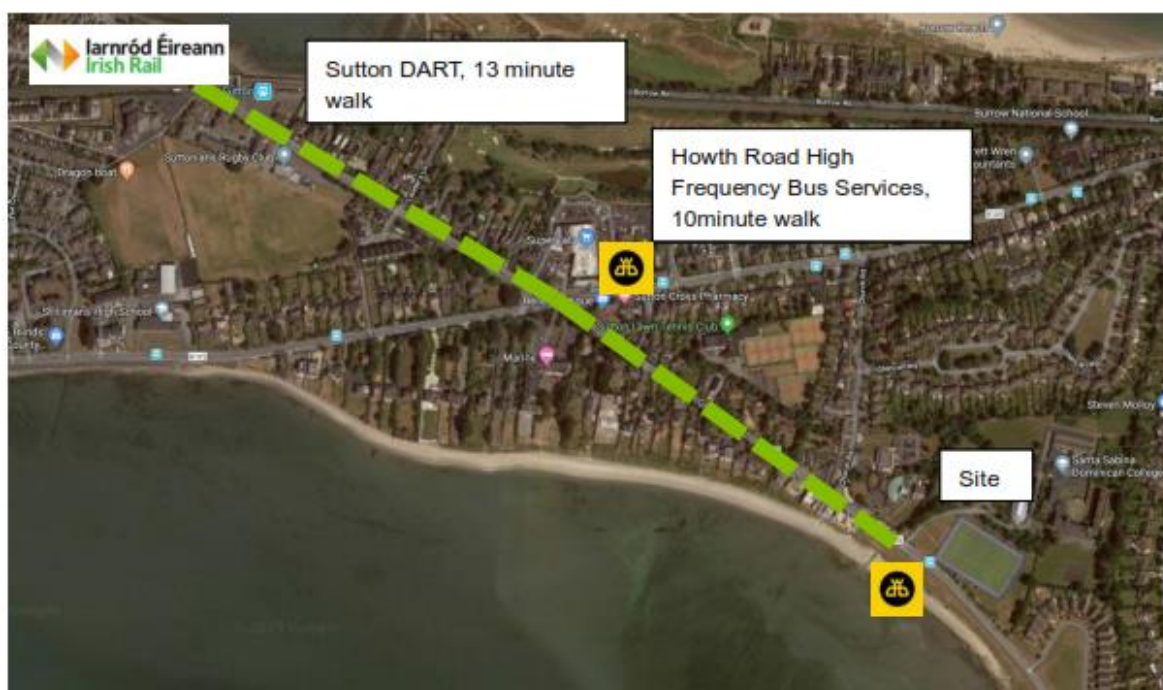
Figure 3.1: Public Transport Accessibility